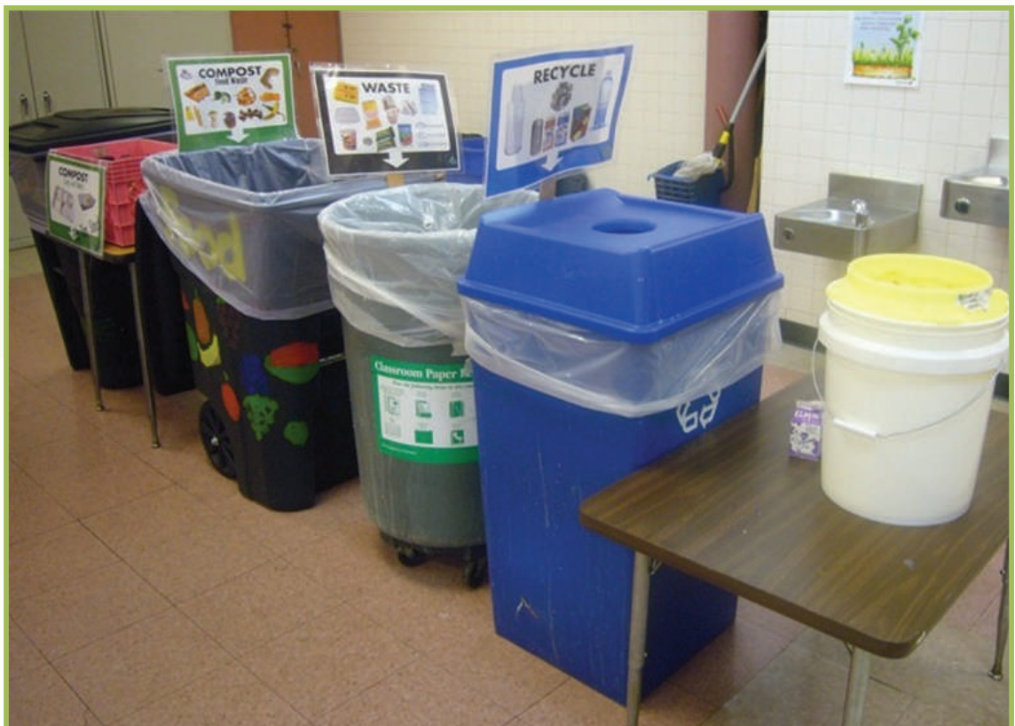
Sample cafeteria recycling station: liquids bucket, recycling, landfill, compost, and food donations.